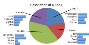
Figure 1: Analogy of Distributions for Topics and Actions

describes an action while the task of the recording session is represented by the distribution of actions. Hence inferring a topic with LDA performs AR and the distribution of the inferences enables us to approximate PR simultaneously.