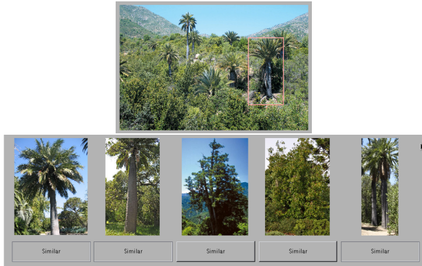
Figure 2: Human interaction GUI. Given a target image (top), the user is shown candidate matches under the current distance metric (bottom), and is asked to indicate which images appear to be true matches.

et al [5] for both offline and online learning. Given a pair of exemplars with known class labels, the approach minimizes a regularized loss function based on the squared Mahalanobis distance as a function of the covariance matrix. We adapt this approach to a batch method by using it as a sub-routine in a pocket-algorithm fashion. We iterate over all pairs in the training set and evaluate the total error. As in the pocket-algorithm we retain the best solution so far until many iterations without improvement are observed.