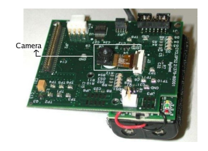
Figure 1: Cyclops low-power camera sensor.

be improved by exploiting alternate sensing modalities that may reduce energy requirements without sacrificing system reliability.