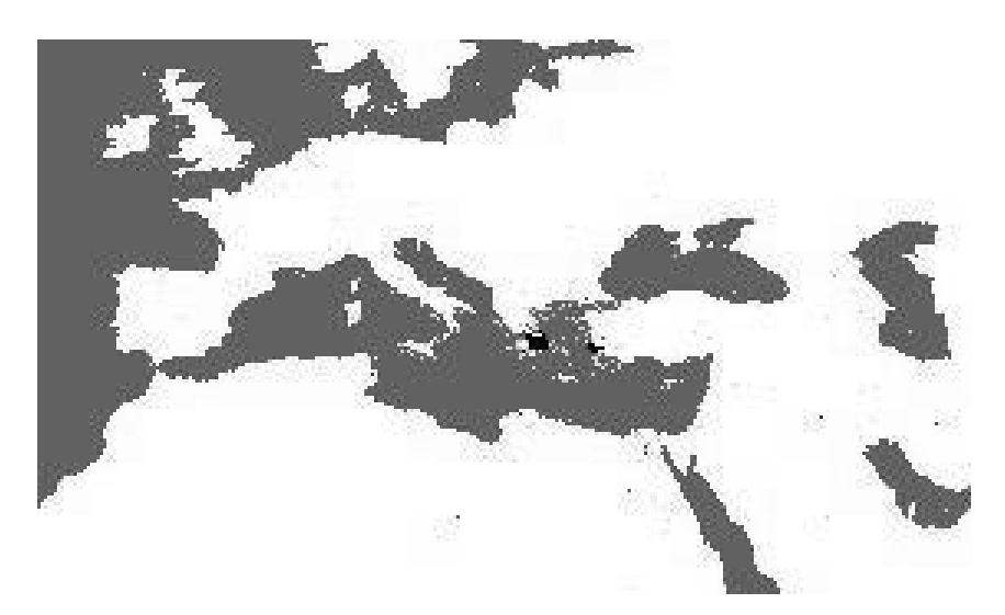
Fig. 2. Sites mentioned in Herodotus. Note the strong concentration in presentday Greece and western Turkey.