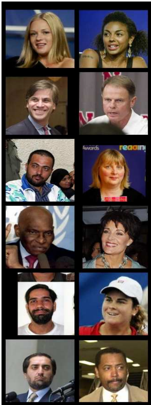
Fig. 2. Mismatched pairs. These are the first six mismatched pairs in the database under View 1, as specified in the file pairsDevTrain.txt .

While some other databases (such as the Caltech 10000 Web Faces [1]) also present highly diverse image sets, these databases are not designed for face recognition, but rather for face detection. We now discuss the origin for Labeled Faces in the Wild and a number of related databases.