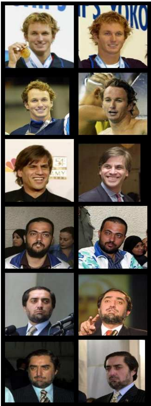
Fig. 1. Matched pairs. These are the first six matching pairs in the database under View 1, as specified in the file pairsDevTrain.txt . These pairs show a number of properties of the database. A person may appear in more than one training pair (first two rows). An image may have been cropped to center the face (3rd row, right image) according to the Viola-Jones detector, but the image has been padded with zeros to make it the same size as other images.

Viola-Jones face detector [35], but have been rescaled and cropped to a fixed size (see Section VI for details). After running the Viola-Jones detector on a large database of images, false positive face detections were manually eliminated, along with images for whom the name of the individual could not be identified.